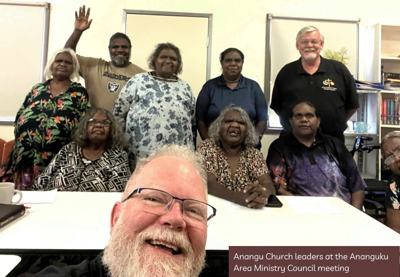
Anangu Church leaders at the Ananguku Area Ministry Council meeting