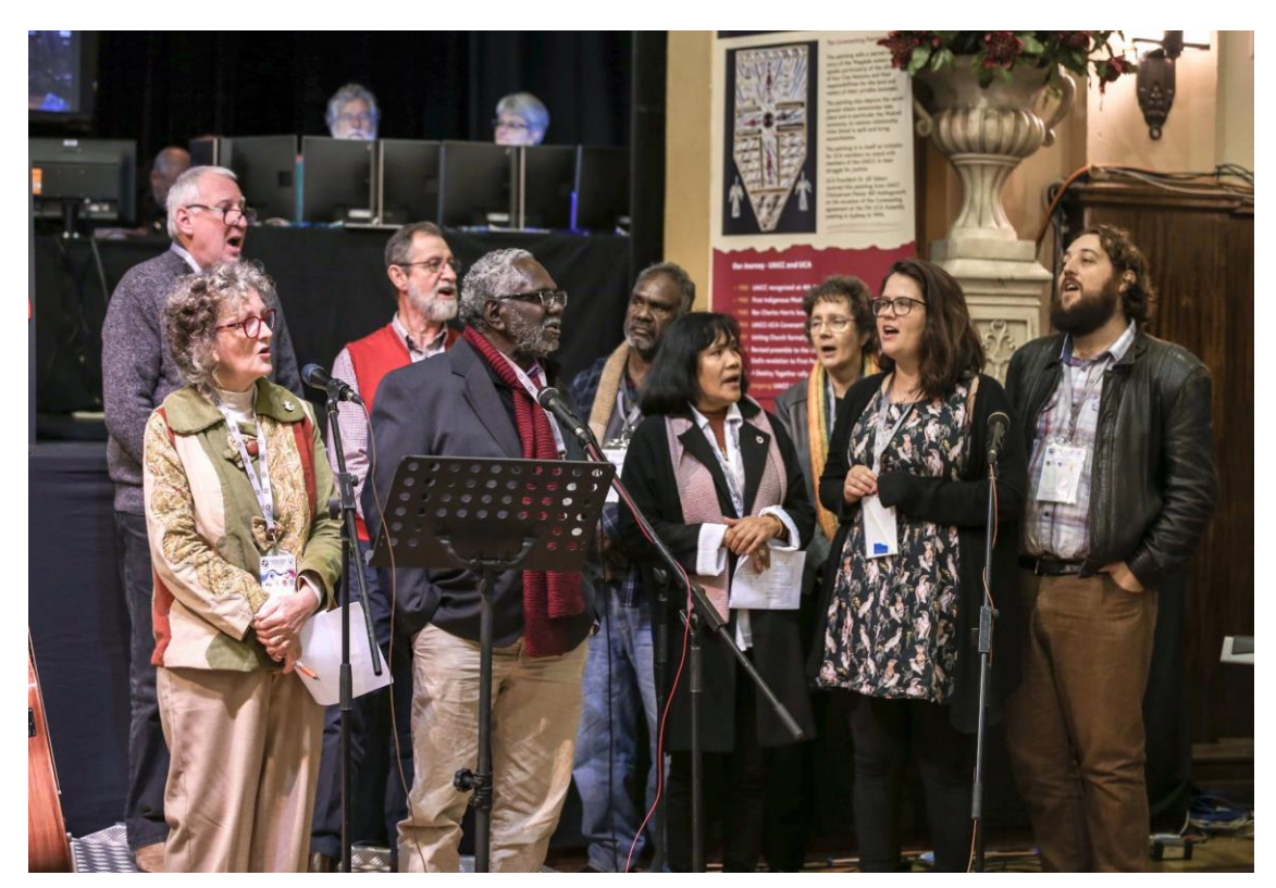
~Sharing Your Life Message~

Forty-second Annual Meeting of the Synod Friday 5<sup>th</sup> October to 7<sup>th</sup> October 2018 St Philip's College, Alice Springs