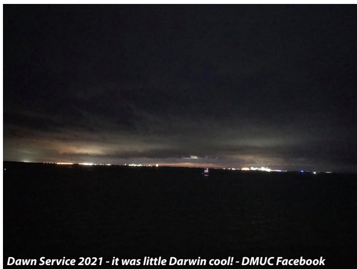
Dawn Service 2021 - it was little Darwin cool! - DMUC Facebook