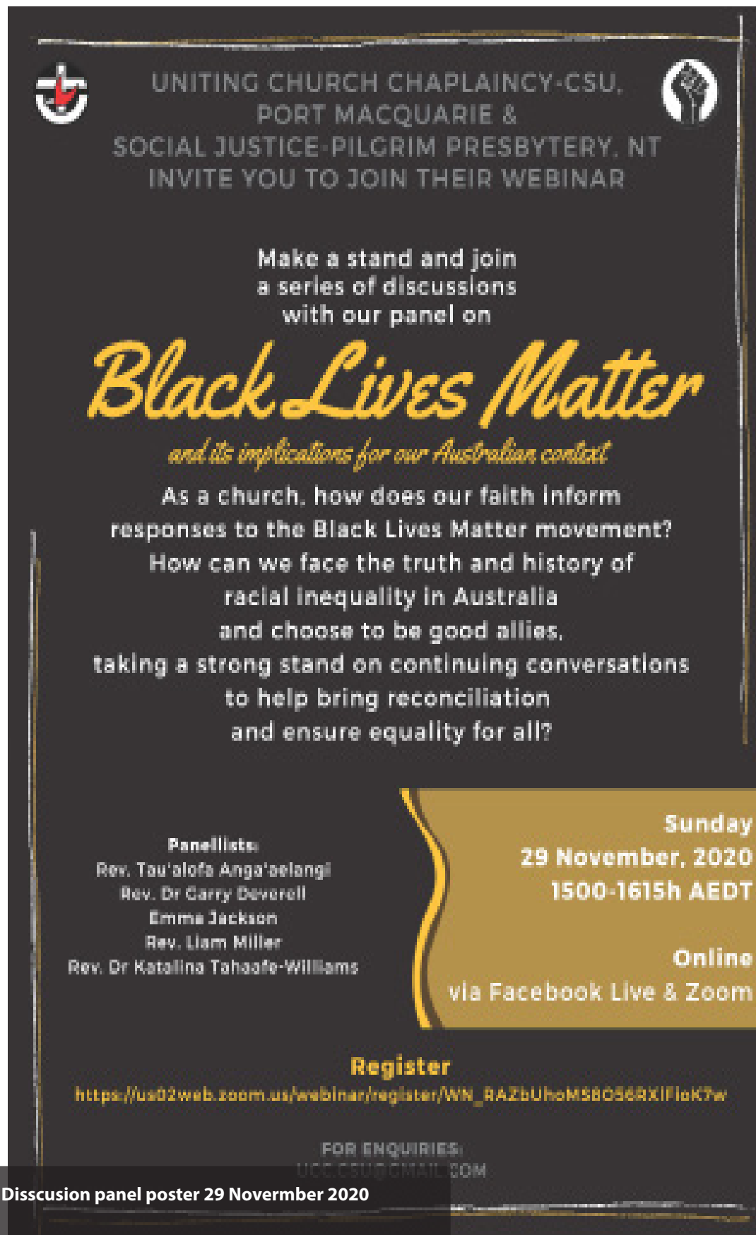
BLM Discussion panel poster 29 November 2020