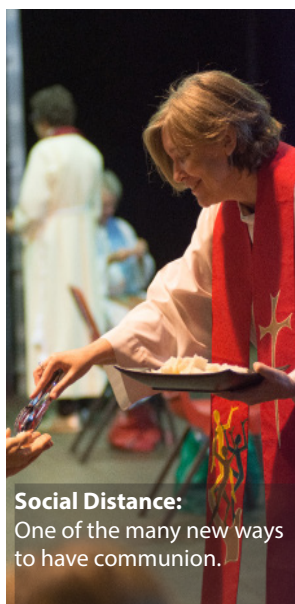
Social Distance: One of the many new ways to have communion.