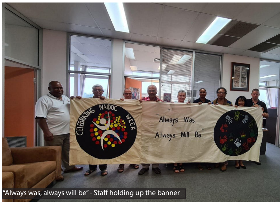
"Always was, always will be" - Staff holding up the banner