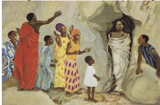
Raising of Lazarus, Jesus Mafa painting

Kids Bulletin & activity sheets (attached) https://sermons4kids.com/