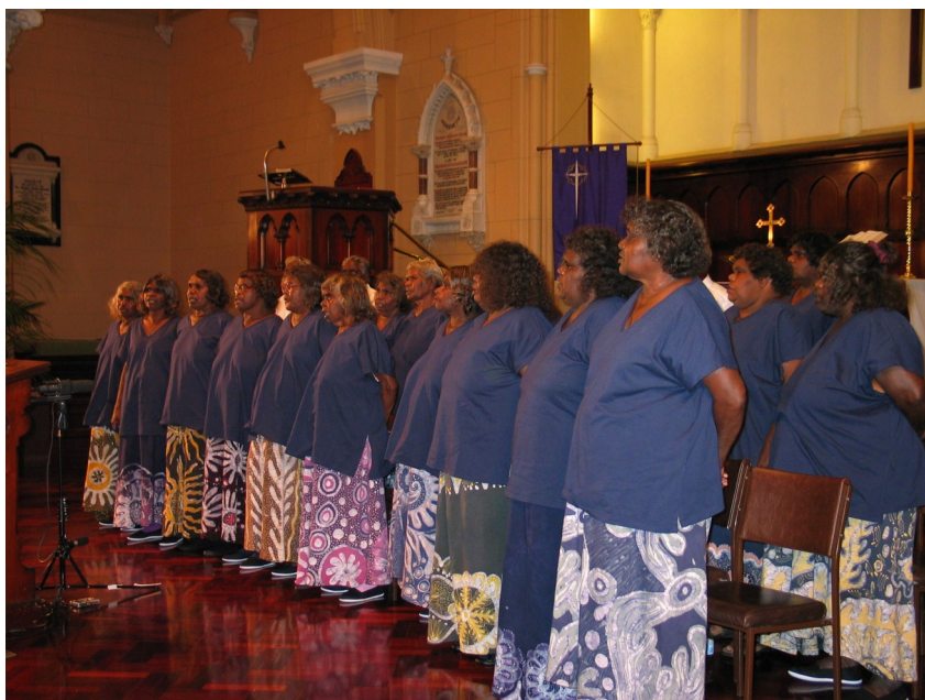
The Ernabella Choir