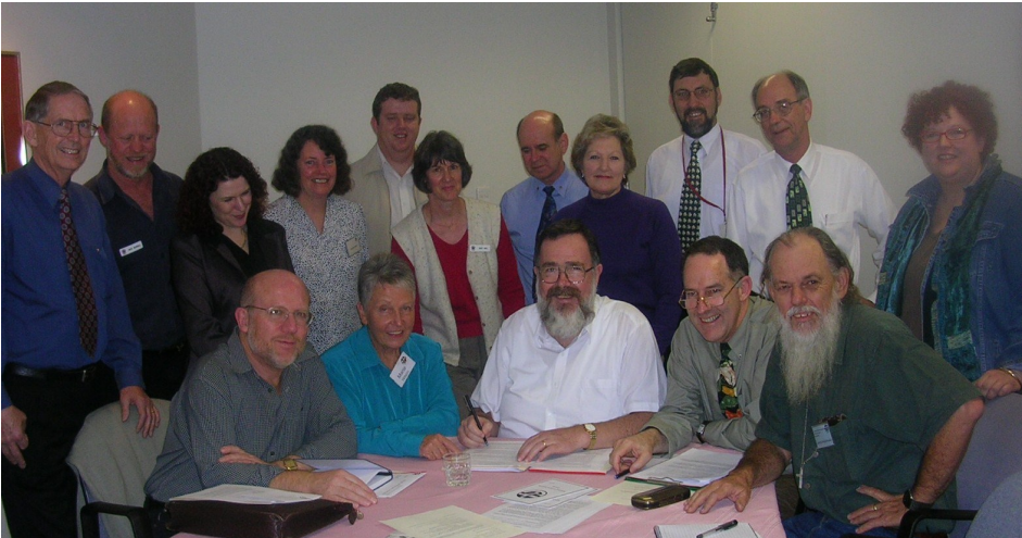
The Inter-Synod working party meeting in Perth, July 2004. The photographer asked me to sign something—the group said it was not an agreement for the Northern Synod to take over!

The synods of SA, WA and the North are exploring inter-synod cooperation. There is agreement to share information about placements, and a list of future possibilities is on the table for discussion.